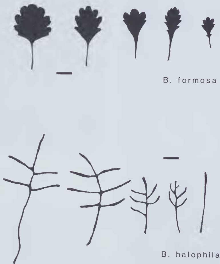
Fig. 1. Leaf variation in single plants of B. formosa (Short 2425) and B. halophila (Conn 2160). Basal and near basal leaves on left to uppermost cauline leaves on right. Scales = 1 cm.

Perennial herb , to c. 15 cm high, rhizomatous, glabrous. Leaves cauline, alternate, mainly green but often purple, particularly on the lower surface; petiole absent or c. 3-25(31) mm long, the base decurrent; lamina usually circular to elliptic or widely obovate to obovate, rarely oblanceolate, 10-30 mm long, (4.5)7-24 mm wide, with 3-7(11) lobes, the lobes sometimes 1 or 2 toothed. Capitula solitary, terminal, heterogamous, radiate. Involucre 5-8 mm diam.; bracts 14-26, overlapping, elliptic or obovate, 2.6-4.5 mm long, 0.9-2 mm wide, mainly herbaceous but with scarious margins. Receptacle conical, pitted, glabrous. Ray florets female, 19-34; corolla 9.8-15.8 mm long, 1.8-2.6 mm wide, pink. Disc florets bisexual, 40-83; corolla 2.5-3.6 mm long, 0.7-1 mm diam., yellow; stamens 5; anthers 1.05-1.45 mm long, microsporangia 0.8-1.2 mm long, apical appendages 0.2-0.4 mm long, base obtuse, endothelial tissue radial, filament collar straight in outline and composed of uniform cells and basally not thicker than the filament; pollen grains (2910)3000-